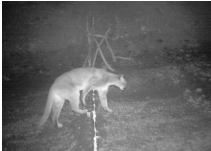
Fig. 4. Cougar passing through hair-sampling system at one of the wildlife underpasses in Banff National Park.

species may be reluctant to use wildlife crossing structures adapted for hair sampling. However, with time, some animals appear to adapt to them and use them regularly.