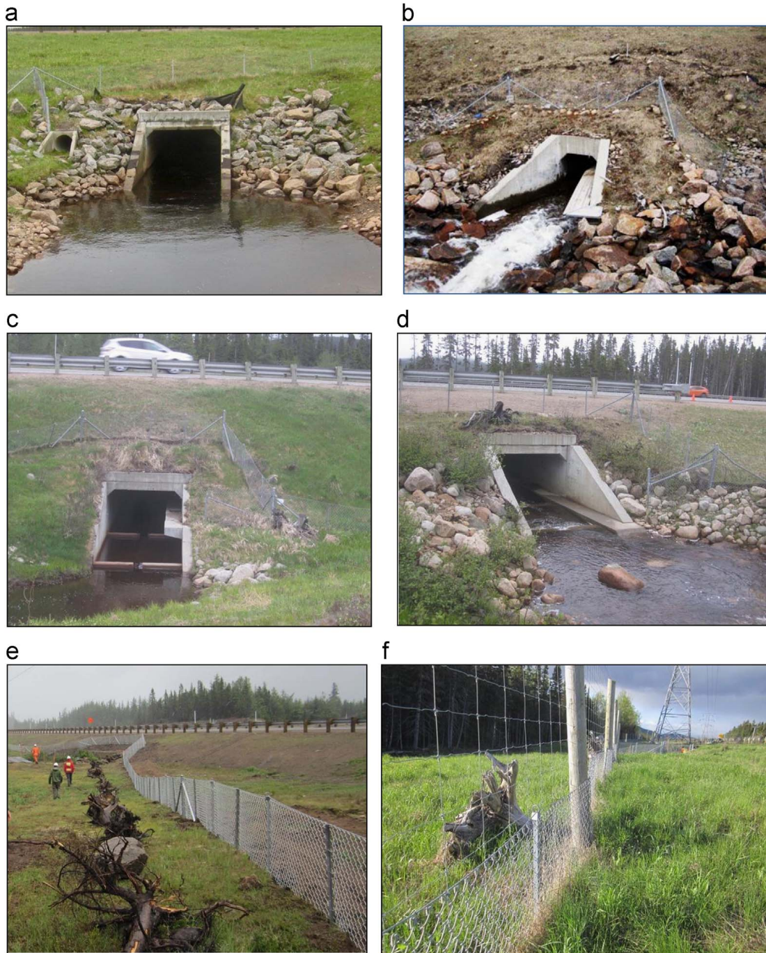
Fig. 2. The four types of wildlife underpasses designed for small and medium-sized mammals and the two types of fences along Highway 175: (a) pipe culvert or round concrete culvert (on the left next to the water culvert; n = 6 ), (b) box culvert with a wooden ledge ( n = 4 ), (c) box culvert with a concrete ledge ( n = 7 ), (d) box culvert with a concrete walkway ( n = 1 ), (e) fence for medium-sized mammals, and (f) combined fencing for large mammals (upper half) and medium-sized mammals (lower half).